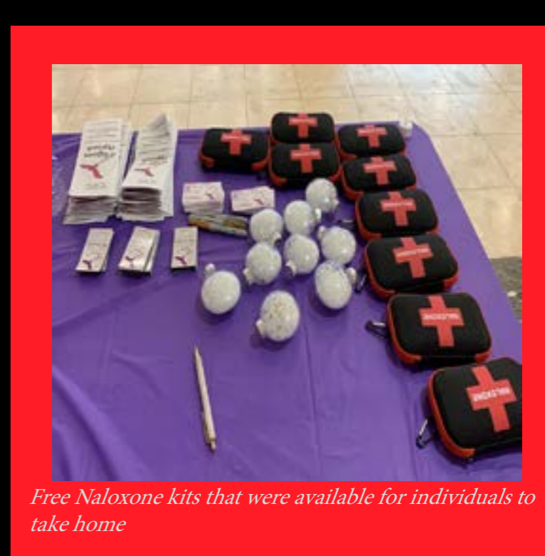
Free Naloxone kits that were available for individuals to take home