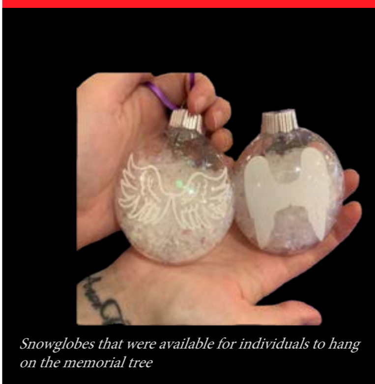
Snowglobes that were available for individuals to hang on the memorial tree