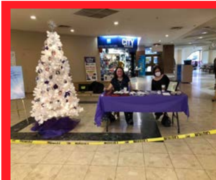
SUAP staff onsite

Every year, MomsStopTheHarm and PARN-Your Community AIDS Resource Network put together a memorial for those lost to overdose or substance use in our community. This year, E FRY was invited to participate. Individuals were invited to place a bulb with a name or photo on the tree of those they have lost. Individuals were also offered free Naloxone kits and training on how to respond to an opioid overdose.